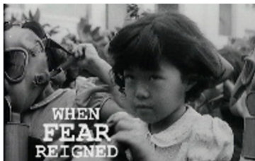
When Fear Reigned