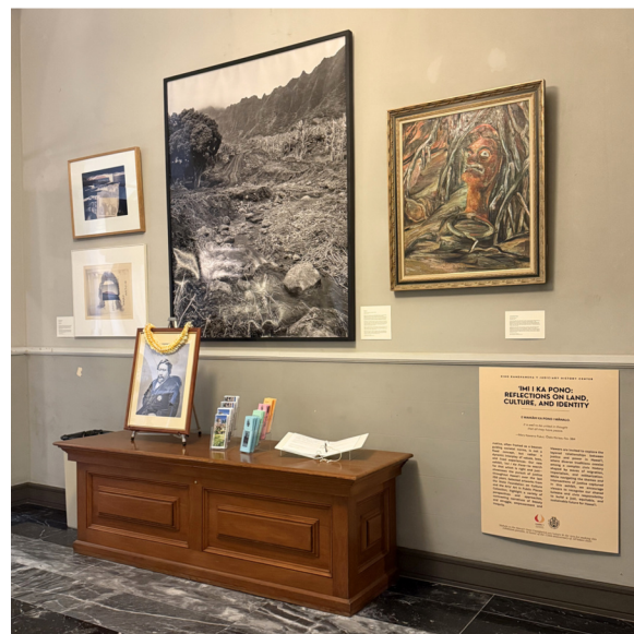
'Imi i Ka Pono: Reflections on Law, Culture, and Identity