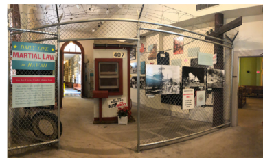
Hawaii Under Martial Law