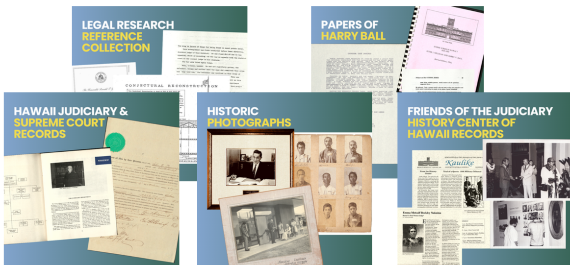
Featured collectons from the Center's Digital Archive