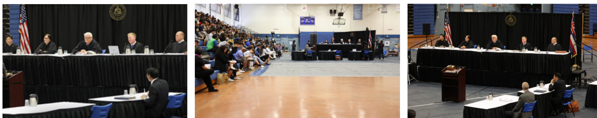
CITC at Kailua High