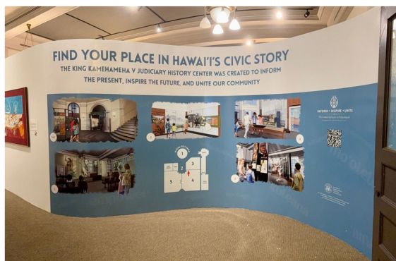
Exhibit Planning Mural