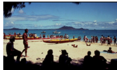
Law of the Land