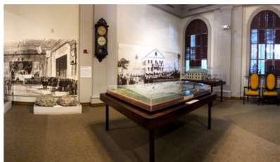
Monarchy Court Gallery