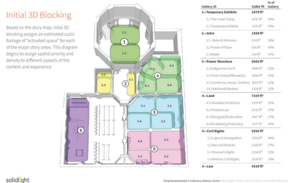
New Museum Floorplan Mockup