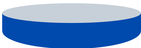
Figure 1: Criminal Justice Funnel for Pretrial Data

Arrests occur with local police, and arrest data are aggregated in CJIS.