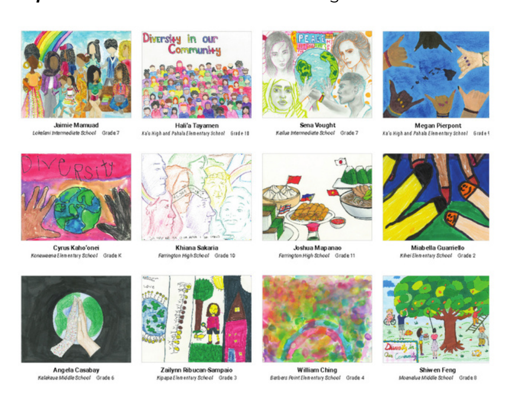
Bar Association Civic Education Committee.

"The yearly celebration of Constitution Day is awesome. It combines past, present, and future issues into a day of respectful thought. I look forward to combined online/in person future celebrations." - Program Attendee